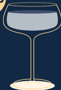
Pear cucumber cooler