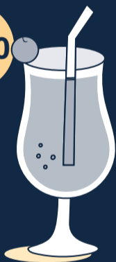
Sex on the beach